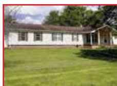
13456 SR 7 Proctorville