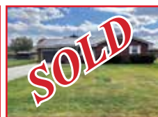
5821 E Pea Ridge Rd. Huntington