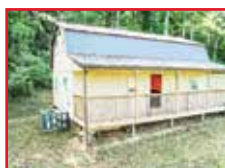
N Rife St Middleport