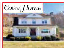
2172 CR 32 Chesapeake