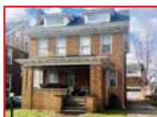
1409 15th St Huntington