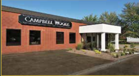
Offices in Huntington, WV and Ashland, KY