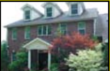
OH-11 Ironton $499,900 4 BR, 4.5 BA