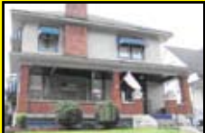
OH-41 Ironton $115,000 3 BR, 1.5 BA