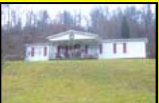
OH-35 Ironton $89,000 3 BR, 2 BA 10.5 Acres