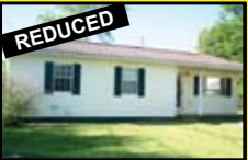
REDUCED OH-24 Proctorville $94,500 3 BR, 1.5 BA