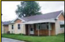
OH-9 Ironton $57,500 3 BR, 1 BA