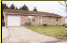
OH-16 South Point $99,000 3 BR, 1 BA