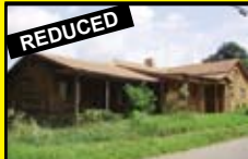
REDUCED OH-1 Coal Grove $27,500 2 BR, 1 BA, Being Sold "AS IS"