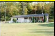
OH-58 Pedro $134,900 3 BR, 2 BA, 3 Acres

Quality Listings, Quality Service & Quality Results