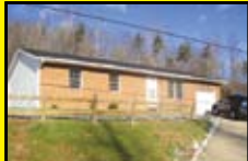
OH-36 Ironton $75,000 3 BR, 1 BA