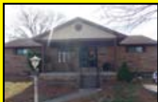
OH-43 Haver Hill $199,900 2 BR, 1 BA