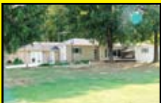
OH-57 Pedro $199,900 3 BR, 2 BA, 60 Acres