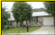
OH-25 Ironton $129,900 4 BR, 2.5 BA