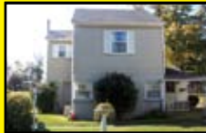
OH-18 Ironton $59,000 3 BR, 1 BA