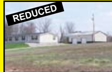
REDUCED OH-40 Oak Hill $105,000 3 BR, 2 BA