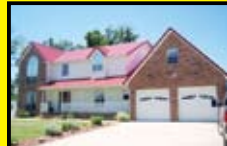
OH-6 Ironton $249,000 4-5 BR, 2.5 BA, 1.5 Acres