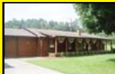
OH-50 Ironton $189,000 3 BR, 2 BA, 12+/- Acres