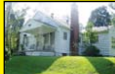
OH-8 Ironton $82,000 3 BR, 1 BA, 15+/- Acres