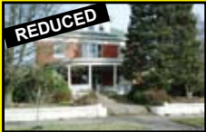
REDUCED OH 22 Ironton $275,000 6 BR, 3 BA