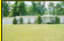
OH-5 Waterloo $79,900 4 BR, 2 BA