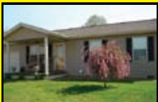
OH-30 South Point $112,500 3 BR, 2 BA