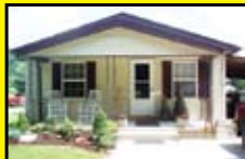
OH-28 South Point $85,000 3 BR, 1 BA