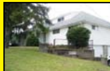
OH-27 South Point $129,000 3 BR, 1.5 BA