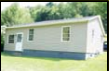
OH-42 South Point $49,900 2 BR, 1 BA