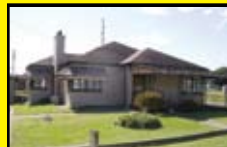
OH-29 South Point $99,900 3 BR, 1 BA