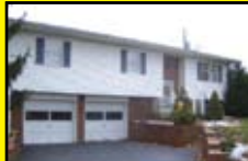
OH-38 South Point $147,500 4 BR, 2 BA