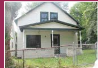
Investors - HURRY! $14,900