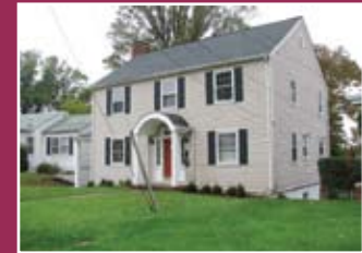
Great Buy $129,900