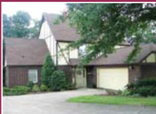
Ona Beauty $174,000