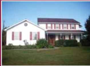
Fairland Schools Fabulous Home $215,000