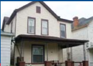
1917 18TH - $55,000