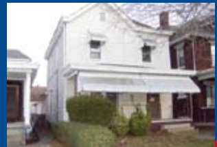
1706 GRANDVIEW - $75,900