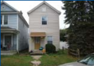
5960 WOODLAND - $39,900