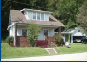
8461 US 52, STOUT - $62,000