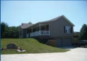
6-D HEHER LANE - $209,900