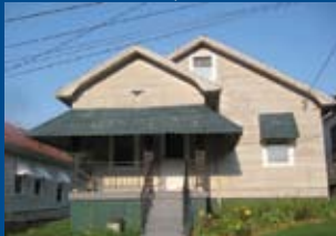
1228 ALLARD ST. $67,900