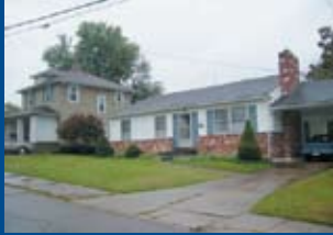
1030 RUHLMAN, PORTSMOUTH