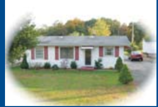
974 THOMAS HOLLOW, LUCASVILLE