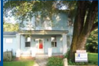
11960 GALLIA PIKE - $43,300