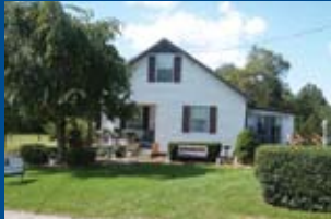
401 OPPIY HILL 60 BEAUTIFUL ACRES - $195,000