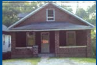
3004 HARRISONVILLE AVE. - $35,900