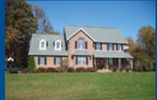
1683 THOMAS HOLLOW - $292,900