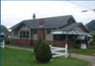
5612 5TH - $34,500