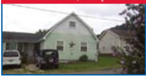
314 Center St., Valley View

Old fashioned friendly neighborhood! This home features 1 st floor oversized BR, 1 st floor BA, spacious kitchen & dining area too. 2 nicely sized BR up with ample closet space. Don't miss this one! Call John or Ruth Arnett @ 574-1114 S135070