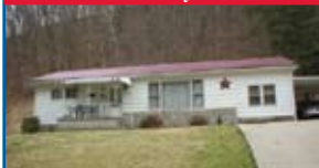
3114 Melody Lane

Lovely home on 1/2 acre lot. New metal roof & gutters. All newly painted & wallpapered. Dead end street, paved drive, carport, 3 BR. Nice ranch home. $65,000 Call Phyllis Pertuset 372-7118 or 352-7091 S134606