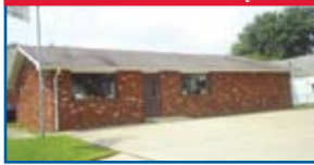
1912 Jackson Ave. - Beauty Salon