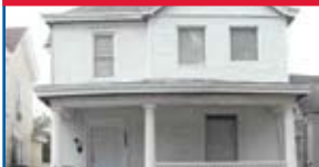
1632 7 th St.

Income producing property, nice duplex w/separate utilities. Currently rented. Call Lesley Book @ 464-0911. S134992