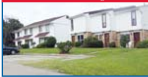
3573 Tick Ridge