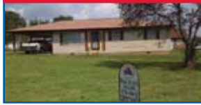
126 Oliver St. Piketon