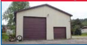
1939 Rheims - New Listing

Lg commercial garage 44'x36', 16' high w/2 doors 14x14 & 8x9. Alarm system. 200 amp electric service. 24'x30' garage. Large lot, room to build your home. This could be residential or commercial, with lots of off-street parking. Call Phyllis Pertuset @ 352-7091 S135033