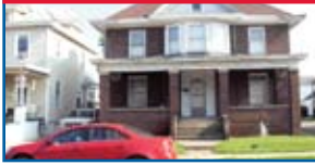
1557 5 th St.

Income producing property. 3 units, 2 in main structure w/1 det. unit. Downstairs apts has 1 BR. Upstairs has 2 BR. Fully furnished & tenants in place. Potential of another apt over beauty salon. Call Lesley Book @ 464-0911 S135099