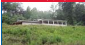
1279 Limerick Rd.