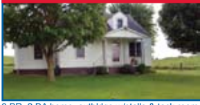
1272 Wheelers Mill Rd.

3 BR, 2 BA home, outbldgs w/stalls & tack room. Working gas well. Side porch recently remodeled into FR w/new vinyl siding & gas space heater. Full bsmt w/FR. 2 car det. garage. Located in area of newer constructions. Call Nancy Hawk @ 821-7344 S132922