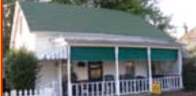
104 Market St., Vanceburg

Cute cottage right down town. Only a block from the river! $52,000