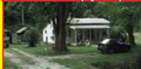
Trace Creek (Ky 1149)

75 acres with 2 BR farm house, small barn & city water. $79,000