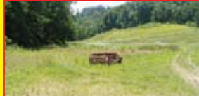
Copperhead Lane, Grayson

194 acres, 5 miles from Grayson off Everman Creek Rd. $225,000