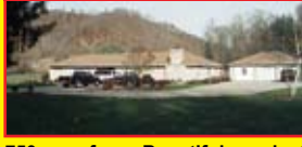
Briary Rd., Garrison

750 acre farm. Beautiful ponds, 2 barns, many more extras. 3100 sq. ft., 4 BR, 3.5 BA home, inground pool, 2 car garage $950,000