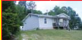
1146 French Rd., Olive Hill

160 acre Hilltop Farm, 2 BR, 1 BA house on 50 acres pasture, 110 wooded $250,000