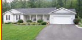
91 Wilburn Lane, Garrison

Newer 3 BR, 2 BA vinyl ranch on large lot facing AA Highway. Call Dave today! $179,000