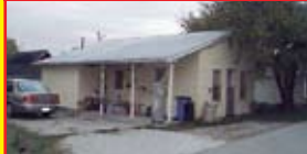
701 3rd Street

Cute 2 BR, 1 BA home, great starter home or rental property. $20,000