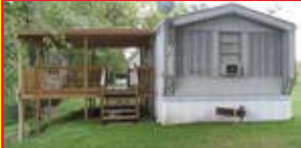
Fannin Ln., Vanceburg