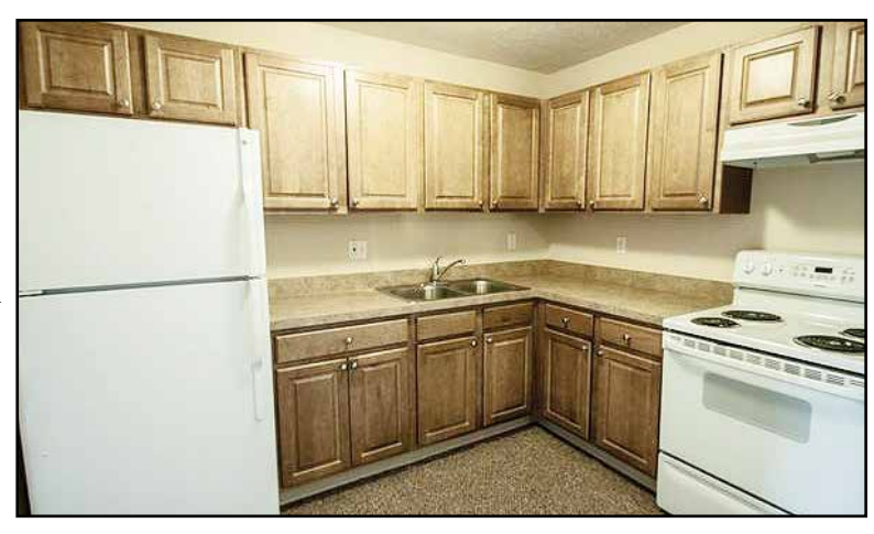
Located in East Pea Ridge 7150 Beech Drive, Huntington, WV 25705 Come into the office between 8:30 am - 11:00 am Monday-Friday to fill out an application