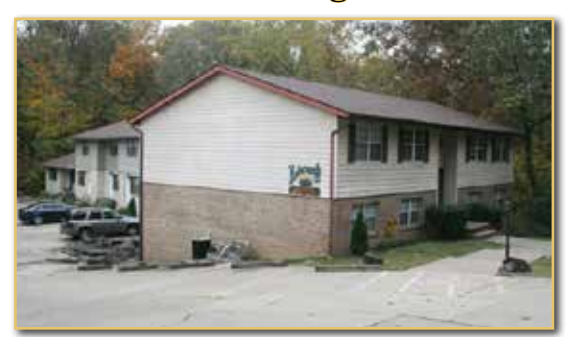
Timberwoods II Apartments 5940 Mahood Drive