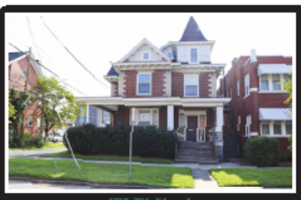
522 7th 5treet

Hood Realty Company has one of the most extensive lists of properties in the Huntington area. With 130 units in 30 locations, Hood Realty Company will be able to help you find your perfect renting space.