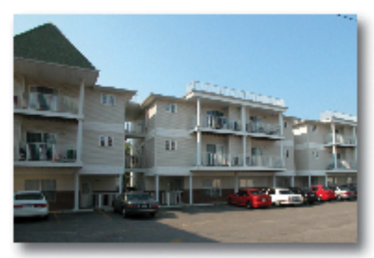
620 15th Street

Email us at dtarter@myvarsityplace.com , call 304-697-5381 , or stop by our information. Center at 613 20th Siree .