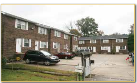
Curry Avenue Apartments 6200 Curry Avenue

We have full time staff & maintenance on call 24 hours.