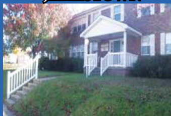
515 MONROE AVENUE