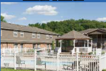
1616 SPRING VALLEY DR.