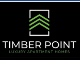
Timber Point 304-429-6388