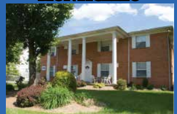
2203 ADAMS AVENUE