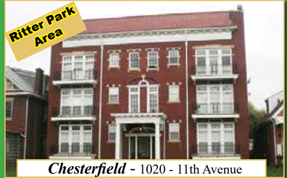
Chesterfield - 1020 - 11th Avenue