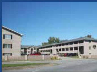
J. R. Smith Enterprises 304-525-3055