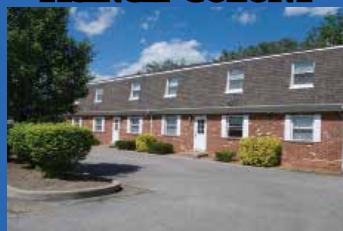
2305 ADAMS AVENUE