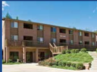
Garden Park 304-736-RENT (7368)