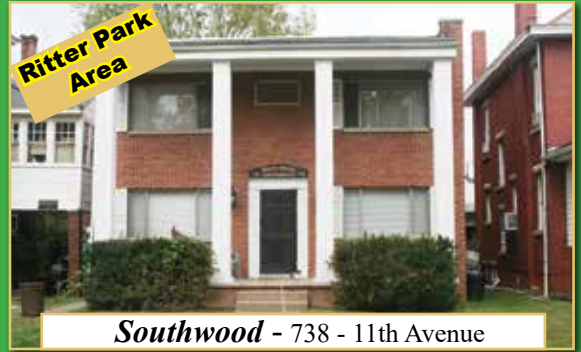
Southwood - 738 - 11th Avenue