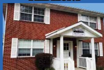
3024 PIEDMONT ROAD