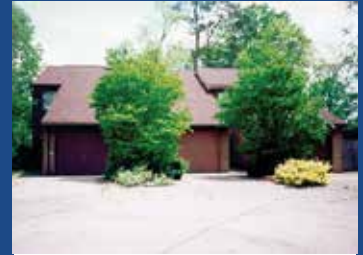
Melody T. Farms Inc. 304-736-2345