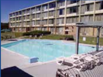
Country Hearth 740-377-2786