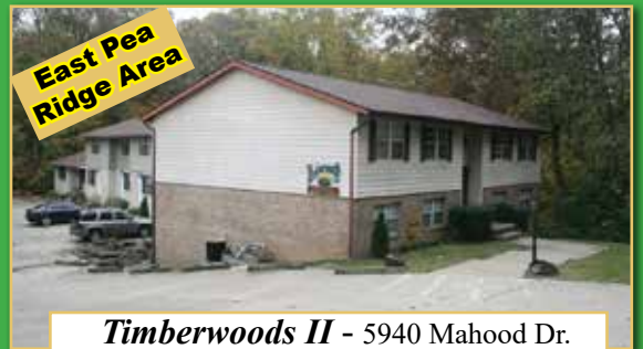
Timberwoods II - 5940 Mahood Dr.