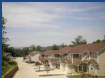
Seneca Ridge 304-522-4200