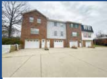
Hyde Real Estate 304-693-6861