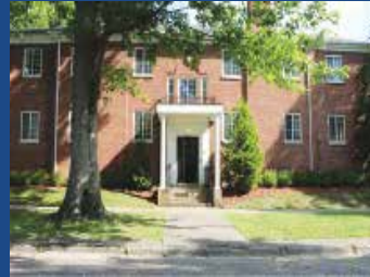
Hood Realty 304-522-6252