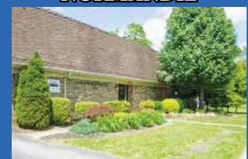
946 MADISON AVENUE

Park Place Properties offers a variety of quality designed studio, one, two and three bedroom apartment homes located near the Huntington VA Medical Center, Marshall University School of Pharmacy, and downtown Huntington.