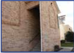
St James S