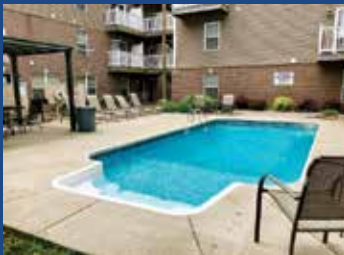
Huntington Apartments 304-522-0293