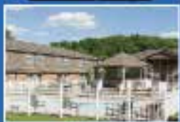
1616 SPRING VALLEY DR.