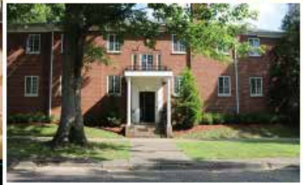
902 11th Avenue