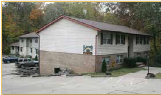
Timberwoods II Apartments 5940 Mahood Drive