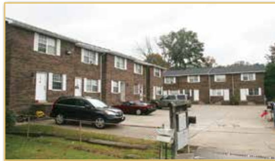
Curry Avenue Apartments 6200 Curry Avenue

We have full time staff & maintenance on call 24 hours.