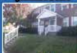
515 MONROE AVENUE