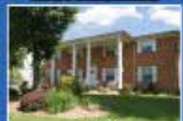
2203 ADAMS AVENUE

Park Place Properties offers a variety of quality designed studio, one, two and three bedroom apartment homes located near the Huntington VA Medical Center, Marshall University School of Pharmacy, and downtown Huntington.