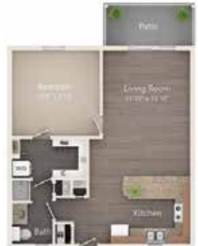
Studio - 375 Sq.Ft.