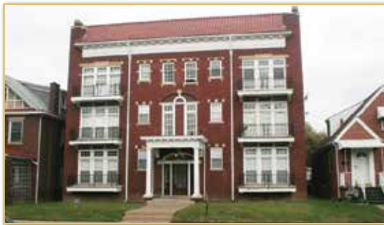
Chesterfield Apartments 1020 - 11th Avenue