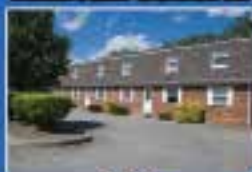
2305 ADAMS AVENUE