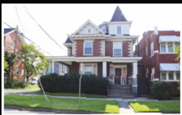
522 7th Street