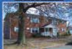
729 10TH STREET WEST