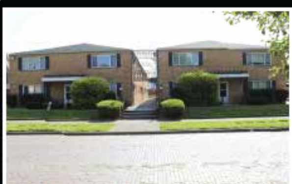
912-918 6th Street