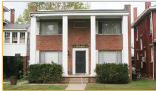
Southwood Apartments 738 - 11th Avenue