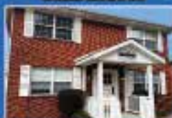
3024 PIEDMONT ROAD