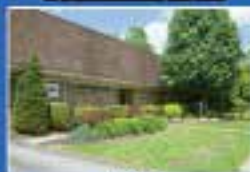
946 MADISON AVENUE