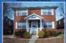
980 MADISON AVENUE