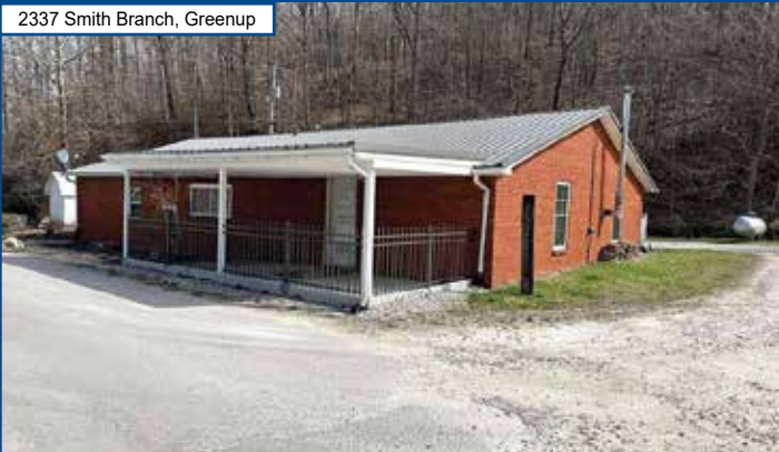
2337 Smith Branch, Greenup