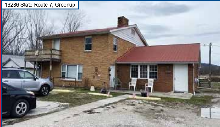
16286 State Route 7, Greenup

Beautiful Space! And over 2000 sq.ft. of it! Former Church well renovated into a clean updated home, featuring a MASSIVE and handsome wide open family room, dining room & kitchen area. Hard to imagine a more open floor plan than this. Updated bath, 2 BR, plus another possible bedroom boasting nearly 500 sq.ft. of space. Check this one out, it may not last long. $89,900 Tracy Edwards 606-571-8007