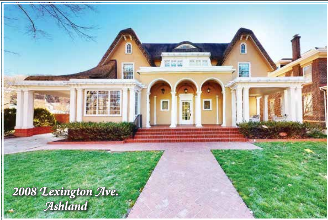
2008 Lexington Ave. Ashland

You won't want to miss the character and charm that this iconic piece of Ashland's history overlooking Central Park has to offer! Call today!