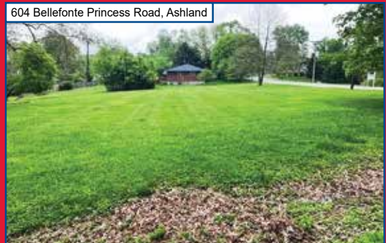
604 Bellefonte Princess Road, Ashland

1.25+/- acres of hard to find flat land in the heart of one of the finest neighborhoods. Build your Dream home or even a couple of houses in this prime spot. $129,000 Tracy Edwards 606-571-8007