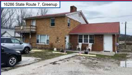
16286 State Route 7, Greenup

This home offers great potential!!! This home design offers three different potential options. 1. Currently live in the lower area and rent out the upper section or mother in law quarters. 2. Buy for an investment as a duplex , rent out both sections plus rent out the detached garage. 3. Put back set of stairs and make it into a 2 Story single family home. Brick/Vinyl exterior, with insulated windows, metal roof and many updates in the past few years. Source of heat: GSFA (propane), Central air, Wood burner, wall heaters, Gas Logs. Enclosed back porch for more storage. Detached metal garage with 1 carport. Call for your private showing. $137,500 Chris Hensley 606-923-9770