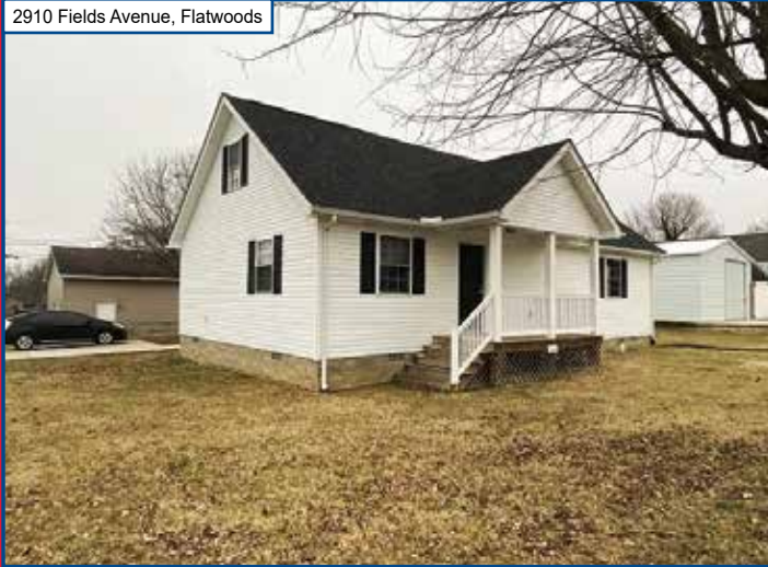
2910 Fields Avenue, Flatwoods