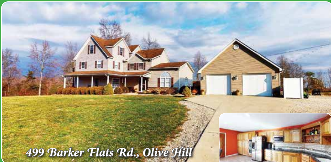
499 Barker Flats Rd., Olive Hill

Beautiful on every level! This home offers a primary suite on the main floor and a private primary suite on the third floor. From top to bottom every detail perfectly flows and leads you to the next room with a balcony view that is grand. The home is equipped with energy efficiency, with GEO Thermal unit along with an outdoor wood burner. There is a large front porch and a large back patio and an above ground pool with level land all around. There is also a 2 car detached garage. Don't wait to schedule your appointment, you don't want to miss out on your dream home.