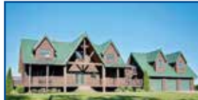
512 Bourbon Ct., Greenup - River living at its best! Luxurious custom log home on the river w/views from every room! 3 BR, 3.5 BA, cathedral ceilings, floor-to-ceiling frpl, wrap-porch, det 3 car garage w/1 BR apt. Gorgeous architecture! $372,500 (TM)