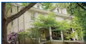
1542 Prospect Place, Ashland - Must See! Exquisite brick only mins from downtown. Grand entrance, HW floors, custom built-ins, beautiful frpls & gourmet kitchen w/granite counter tops. 3 BR upstairs. 4th expansive BR/ bonus room w/ton of storage. $299,900 (TM)