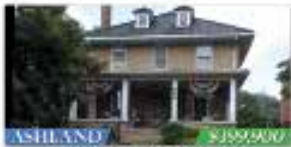
ASHLAND $359,900 1620 BATH AVE Located across from Central Park, this two story brick home has 4 BRs. Fenced patio and two car garage.