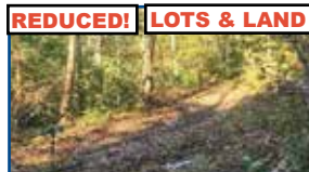
REDUCED! LOTS & LAND

17069 N. St. Highway 7, Grayson - Possibilities are endless with this 90+/- acre tract w/ breath-taking views, just 10 mins from Grayson off AA. Platted & recorded for subd, however could be ideal for folks who prefer privacy w/ livestock or horses. $109,900 (JR)