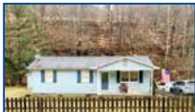
5444 Stinson Rd. - Beautiful home. Perfect for first time buyer! 3 BR, 1 BA, 5+/- acres. $59,400 (JD)