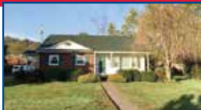
19 Revere St., Greenup - This cozy 4 BR, 2 full BA & 3 car garage is ready to move in! Don't wait. This won't stay on the market long! $179,900 (JD)