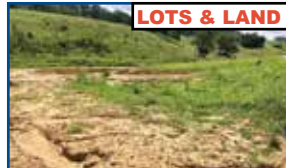
LOTS & LAND

0 Beechtree Lane - Private 1.55 acre building lot in gorgeous Paradise Hills Subd. All utilities available. Super Private! $34,500 (CH)