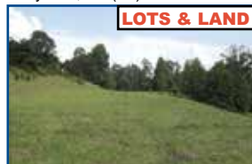
LOTS & LAND

0 Bellefonte Princess Rd, Ashland - 18+/- Acres. $624,900 (CP)