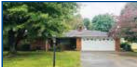
470 Greenup Rd., Raceland - Great opportunity to purchase a one owner custom home in Poplar Highlands. 3 BR, 2 BA, 2 frpl, 2 car garage up & 2 car garage in bsmt. $149,900 (BB)