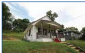
5225 Blackburn Ave., Ashland - 3 BR, 1 BA Cape Cod w/charming living space. 1 BR & laundry on main. FR connects to DR. $49,500 (CH)