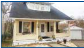
1117 1st Circle Prospect Ave., Ashland - Move-in ready 2 BR, 1 BA Cape Cod style home. Priced to sell. Must See! $78,900 (EM)