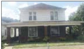
507 Etna St., Russell - Enjoy living in the splendor of this stately home! Adorned w/8 frpl, HW flooring, lovely double staircases, 5 BR, 2.5 BA with so many updates. $129,900 (JB)