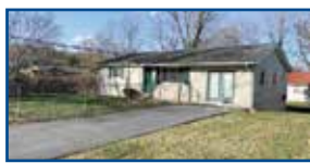
6221 Gillum St., Ashland - Looking for 1 floor plan w/3 BR, 1 BA in Boyd Co/Summit area? This offers 1,200 sq.ft. w/lg updated, fully equipped eat-in kitchen. Flat fenced yard on dead end. $79,500 (CCJ)