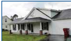
381 St. Rt. 3117, South Shore - 4 BR, 2 BA house with large lot off of US 23. $95,000 (EM)