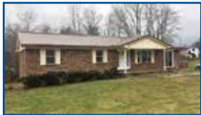
467 St. Hwy 1910 - MOTIVATED SELLERS! This 3 BR, 2 BA home's interior has been remodeled!!! New kitchen, cabinets, HVAC, windows, flooring & roof. Nice size living area & 2 nd huge FR w/wood frpl. $129,900 (JR)