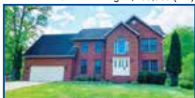
3570 Hearthstone Ct., Flatwoods - Beautiful home w/newer HW floors & hardwood staircase. MBR w/vaulted ceiling & BA and lg bonus/4th BR. Kitchen w/granite tops & SS appliances. Great neighborhood. $245,000 (TM)