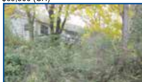
13784 St. Highway 986, Olive Hill - Selling house "as is." Has been vacant before 2-24-12. Nice land that is adjacent to Grayson Lake. Has a barn on back of the land that needs work. $59,900 (PC)