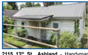
2115 13th St., Ashland - Handyman Special!! 2 BR, 1 BA, 1 car garage. Needs TLC, but can be lived in. Nice back yard! Give us a call. $29,900 (GD)