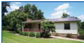
7124 Hickory Hills Dr., Ashland - Beautiful 3 BR, 3 BA, 2 car garage. $169,500 (CCJ)