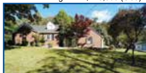
2835 Forest Ave., Ashland - Fabulous classic Cape Cod 3 BR, 1.5 BA w/2 car det garage. Nice stone frpl, top-notch kitchen, Lg LR & DR. $224,500 (CCJ)