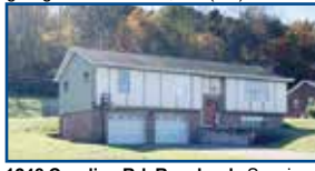
1248 Caroline Rd, Raceland - Spacious 3 BR, 2 BA on .66 acre, 2 car garage, updated flooring, super nice kitchen, screened porch, lg MBR & MBA, & big fenced yard. $149,500 (CCJ)