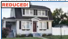
2900 S. 29 th St., Ashland - Beautiful move-in ready. 1st floor master suite, updated kitchen, HW floors, fenced back yard & wireless dog fence. $164,900 (KD)