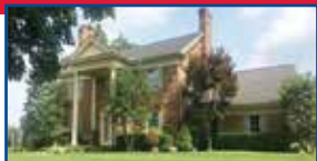
101 W. Stovall Lane, Grayson - Elegant luxury home with breathtaking view of the city skyline on 25+/- acres w/4 BR, 4.5 BA, 3 lg well kept barns & 1 lg bldg for equipment & storage. $595,000 (JR)