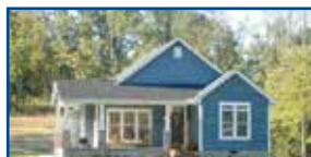
754 Timber Ridge, Grayson - 3 BR, 2 BA home on 3.4+/- acres. LR w/frpl, HW floors, lots of tile, lg farmhouse kitchen w/center island & dining area. $239,900 (JB)