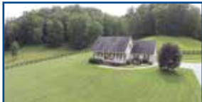
1243 Smith Branch, Grayson - No, this isn't a park! But you are entering a fairy tale! Don't miss this beautiful property w/3 BR, 2 full & 2 half BA, 2 car garage and 20+/- Acres! $439,900 (JB)