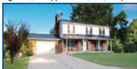
2711 Camellia Dr., Flatwoods - Come look at this stunning 4 BR, 2 full BA in Greenhills Subd. 36x18 inground saltwater pool w/privacy fence. Master suite w/HW floors. 2nd FR in walkout bsmt w/frpl. Det. garage. $245,000 (TM)