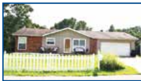
4832 Music Branch, Ashland - Looking to downsize or 1st time buyer? 3 BR, 1 BA, full unfin bsmt, fenced back overlooking AG pool. Home Warranty. $94,900 (GD)