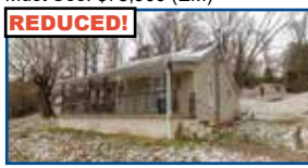
2505 St. Rt. 5, Ashland - 3 BR, 1 BA Cape Cod home on lg lot across from Kingsbrook. MBR on 1st and 2 BR up. Central H/A, storage shed & lg lot. $69,500 (CH)