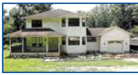
6605 St. Rt. 207 - 3 BR, 3.5 BA 2 story home w/1,704+/- sq.ft., 2+/- Acres, HW floors in living/dining room combo w/WB frpl, 2 nd service kitchen, laundry area, MBR w/double sinks in BA, hobby/rec room. Seller will consider land contract. Down payment negotiable. $163,000 (LS)