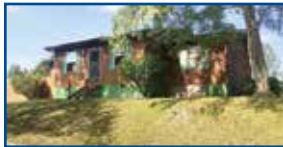
451 Muddy Ridge Rd., Louisa - Check out this 2 BR, 1 BA ranch style w/beautiful views & workable barn. Nice Inground pool w/privacy fence. Also has single-wide w/rental potential. $170,000 (JM)