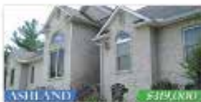
ASHLAND $399,000 832 COUNTRY CLUB DR Lovely 4 BR, 3 Bath home in Bellefonte. 2 additional lots included that connect to this property in the back!

Let Us List Your Home And YOU Can Experience THE PARAMOUNT DIFFERENCE!