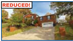
296 Bellefonte Circle, Ashland - Beautiful 4 BR, 2.5 BA in one of the Bellefonte area's most sought after neighborhoods. 2 LR, screened porch, 2 car garage, fenced back yard. $164,500 (CH)