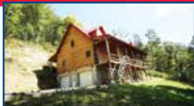
17136 Arthur Lane, Catlettsburg - LOG home on 1 acre of pure privacy offering 4 BR, 2 BA, big bsmt w/2 car garage. Open floor plan & loft area. $174,500 (CCJ)