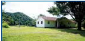
101 Linda Lane, South Shore - Looking for a mini-farm? This graceful flat 14 acre farm has a nice 50x50 barn and 3 BR, 2 BA ranch home w/lg MBA & walk-in closet. $154,500 (CCJ)