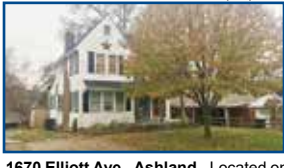
1670 Elliott Ave., Ashland - Located on a quiet street in an established neighborhood. Charming Cape Cod w/4 BR, 1.5 BA, off-street parking, fenced yard, DR, attic & full bsmt. $119,900 (JD)