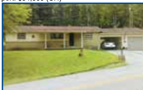
9177 St. Hwy 174, Olive Hill - 2 BR, 1 BA, garage. 11.09+/- Acres. Pond. $45,000 (EM)