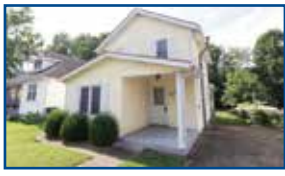
2720 Herman Ave., Ashland - 3 BR, 2 BA in walking distance of downtown. All kitchen appliances stay. Features an office/play room, LR, laundry & full BA on main. Lg kitchen, fenced back yard w/deck. $79,500 (CH)