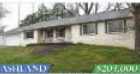
ASHLAND $201,000 130 CAROLINE DR Beautifully renovated 4 BR/ 4 Bath home w/ an in-ground pool and nice patio area! Much larger than it looks!