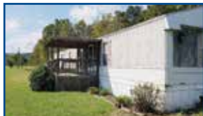
180 Lantern Dr., Grayson - This very well maintained singlewide trailer is on almost 2 acres. 3 BR w/huge MBA w/soaking tub. $60,000 (LF)