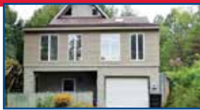
6704 Blackberry Lane, Ashland - 4 BR, 3 full BA custom home NEVER sold before. Offers 3+/- acres, walkout bsmt, vaulted ceilings in kitchen & DR & geo-thermal unit for maximized efficiency. $179,900 (LF)