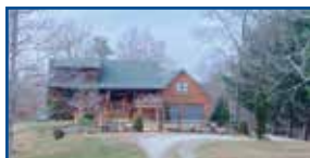
165 Oak Crest Dr., Grayson - Beautiful Log Home with 10.75+/- Acres with so much to offer. 2 ponds. Open concept w/ Lg MBR & BA. $255,900 (PC)