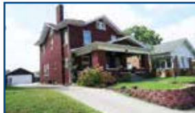
2924 Newman St., Ashland - Beautiful 5 BR, 2 full & 2 half BA home with detached garage. $129,500 (CCJ)