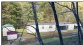
7870 Bayless Hill Rd., Catlettsburg - Private & peaceful setting on 2.6+/- acres. 2006 Clayton singlewide w/3 BR, 2 BA. Well kept. 2 outldg & 2 bay carport. $62,900 (JD)