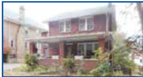
2318 Forest Ave., Ashland - Feel right at home in this lovely brick 2 story with 4 BR & 2 BA. Bsmt w/full kitchen. Deck. $139,900 (LG/LS)