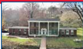
24203 Jacks Fork Rd., Rush - 30+/- Acres. 5 BR, 4 BA. Open concept entertainment area. Black barn-great for storage. Red barn w/10 horse stalls, kitchenette & 2 half baths. $549,900 (CP)