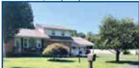
122 Armada Blvd, Raceland - Amazing opportunity to own this one owner custom home in Poplar Highlands. 3 BR, 2 BA, & 196+/- sq.ft. sun room w/window AC. $149,900 (TM)