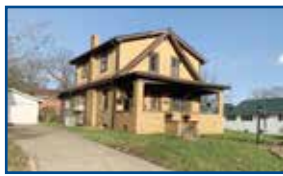
1421 Maxwell Ave., Ashland - Story Craftsman style brick w/ 3 BR, 1.5 BA, 1 car det garage on corner lot. Lots of character. Lg LR, FR w/built-in shelving. $89,500 (CCJ)