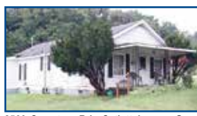
8560 Cemetery Rd., Catlettsburg - Great investor property w/potential. In need of repairs. Close to shopping & schools. Garage in poor condition. 36th St. & Cemetery Rd are the same street. $12,500 (LG)