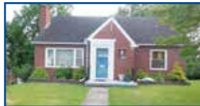
1644 Elliot Ave., Ashland - 4 BR, 2 BA, beautiful home in great neighborhood. Formal DR & LR w/frpl. 2 BR on main. Walkout bsmt w/FR. $135,900 (BB)

Each office independently owned and operated