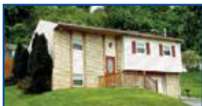
3262 Louisa St., Catlettsburg - Nicely updated 3 BR, 2 BA w/screened porch & inground pool. Open LR, FR & DR & beautiful HW floors. Updated kitchen w/SS appliances. Conveniently located. $105,000 (AY)