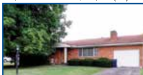
4041 Grandview Dr., Ashland - Great Fixer-upper in very desirable neighborhood. 3 BR, 2.5 BA. Needs work. Selling "As Is". Full unfin. bsmt w/frpl. $105,000 (CCJ)