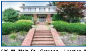
506 W. Main St., Grayson - Location & rich history with this 1800s Victorian home. Includes 1.4 acre, det 2 car garage w/finished space above. Seller is motivated & wants offer. $120,000 (JR)