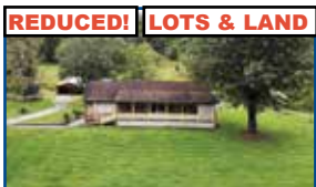
REDUCED! LOTS & LAND

0 Richard Drive, Raceland - 6.31+/- Acre Lot. Call for details. $229,900 (PDC)