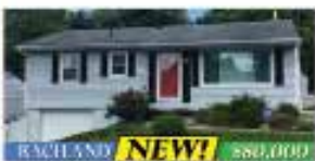
RACELAND NEW! $80,000 302 SHEILA DR 2Br, 1 Bath home located in Raceland. Full unfinished basement. Attached garage, fenced in back yard.

Let Us List Your Home And YOU Can Experience THE PARAMOUNT DIFFERENCE!