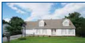
152 Partridge Dr., Russell - Spacious 4 BR, 3.5 BA w/Walkout bsmt w/kitchenette & wet bar. 2 car garage. Main floor FR, Lg MBR, SS appliances. $279,900 (CCJ)