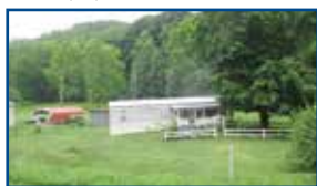
2490 Davy Run Rd., Grayson - 1996 mobile home with easement to access right of way to property. Roof needs replacing. $17,999 (PC)