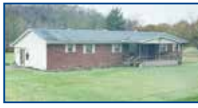
1501 St. Highway 1947, Grayson - Check out this brick rancher on lg level lot. Offers 3 BR, 2 BA with nice pool area for those summer nights. Lg FR & eat-in kitchen. $159,900 (JR)