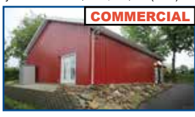
134 Beauty Dr. - Com. bldg out Main St. Offers over 2,000 sq.ft., offices, 12 ft ceilings, plenty of storage & parking in front. Many possibilities. Quality construction! Would make great investment. $125,000 (JR)