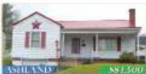
ASHLAND $87,500 1512 BEVERLY BLVD Hardwood Floors, Bonus Room w/ Built-In Storage, Covered Patio w/ Privacy Fence. Property Sold As Is.