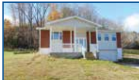
211 Teague Dr., Greenup - Lovely remodeled 3 BR w/lg kitchen, newer BA, roof, windows, sheet rock & paint. Deck in rear & unfin bsmt. $124,900 (LS)