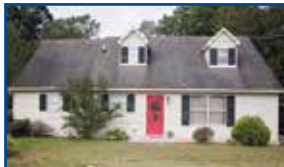
2205 Brent Ann, Flatwoods - Terrific 5 BR home in Russell School Dist. Huge kitchen & dining & spacious LR. Expansive back deck for cook-outs. $129,900 (TM)