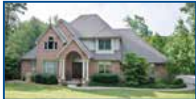
3021 Fawn Lane, Flatwoods - Spectacular 6 BR, 4.5 BA Custom home on 2+/- acres in Caroline Estates. Exquisite foyers, vaulted ceilings, wooded back yard, huge MBR & MBA w/ Jacuzzi tub. Geo thermal HVAC. $477,250 (TM)