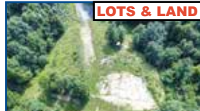
LOTS & LAND

0 Highway 1959 / Substation Rd., Grayson - Ideal for home or homes & pasture for animals. City water & electric available. $69,900 (PC)