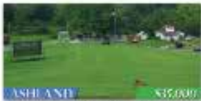
ASHLAND $35,000 EAST ST Residential lots. Lots are level. Ashland school district, public sewer and water.