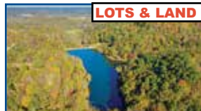
LOTS & LAND

Rt. 1274 South, Frenchburg - Looking for private hunting grounds. This 80+/- acres is near Cave Run Lake. Wooded area & spots to build the perfect get-a-way cabin. $99,000 (JD)