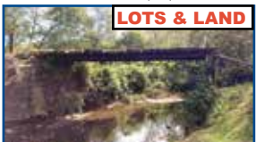
LOTS & LAND

557 Brushy Fork Rd., Catlettsburg - 85+/- Acres as per deed, However 70+/- Acres as per plat. $174,900 (CP)