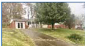
4603 Dawson Lane, Ashland - This 3 BR, 1.5 BA brick ranch might work for you with a little TLC. Off-street parking, lg porch, sizable back yard. $69,900 (JD)