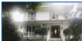
201 Riverside Dr., Russell - Awesome view of Ohio River & new bridge. Lg open upstairs landing leading to lg MBR. Laundry room upstairs. Renovated in 2003. $239,900 (JD)