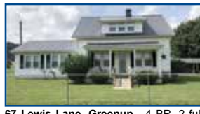
67 Lewis Lane, Greenup - 4 BR, 2 full BA, separate office/study w/built-in shelving. Spacious LR, formal DR, Lg eat-in kitchen, fenced yard, lg det garage. Sold "As Is." $94,500 (KG)