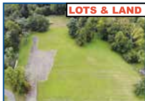
LOTS & LAND

0 Hord St. - Great location in Grayson! Commercial lot close to Justice Center & other downtown businesses. $28,000 (LF)