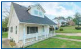
3709 Blackburn Ave., Ashland - Investor Alert! 3 BR, 1 BA, partly updated, but needs completed. Would be great rental or starter. Lg back yard. Unfin bsmt & newly built carport. $54,500 (CH)