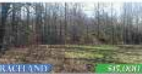
RACELAND $37,000 ACKISON ST LOT 1 Wooded lot In Colvin Hgts. at end of Ackison St. Zoned Residential, public water on site, tap has been paid.