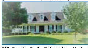
912 Navajo Trail, Flatwoods - Such a beautiful home in a beautiful neighborhood!! A family could not get any luckier than this! 4 BR, 2 BA, 2 car garage w/inground pool! $299,900 (JB/JR)