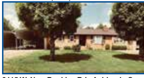
2115 W. New Buckley Rd., Ashland - Open floor plan, well maintained 2 BR, 2 BA ranch, screened porch w/deck, kitchen/DR combo, LR w/frpl, 2 lg metal carports & metal storage bldg. $149,500 (RW)