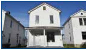
2021 Central Ave., Ashland - Directly across from Central Park. Totally updated 3 BR, 2 BA home that is move-in ready. $98,900 (GD)