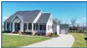
1321 Emma Kaye Blvd, Greenup - WOW! 5 BR, 3.5 BA 5 yr old custom home on 1.44 acres. Open floor plan w/ vaulted ceilings. $334,500 (CCJ)