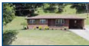
3928 W. US Hwy 60, Grayson - 3 BR, 1.5 BA brick on 1+/- acres. Move-in ready w/kitchen appliances & washer/dryer included. New security & fire system & new BAs, windows, doors & more. FR w/WB frpl, eat-in kitchen w/bar area, DR & unfin bsmt. $117,000 (JB)