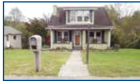
1203 Woodland Ave., Flatwoods - Move-in ready!! 3-4 BR, 2 BA, garage. Close to city pool. HW floors & gas log fireplace. $99,900 (PDC)