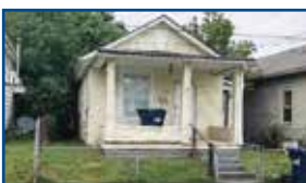
449 31st St., Ashland - 2 BR, 1 BA, great rental property or starter home. Roof only 3 yrs old. $15,000 (RW)