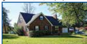
100 Buena Vista Drive, Ashland - Step out of this 5 BR, 3 full BA with garage, onto the covered patio area that overlooks the lg flat back yard where family and friends can gather. $240,000 (CCJ)