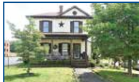
3279 Oakland Ave., Catlettsburg - 3 BR, 1 BA, garage. Charming home. Don't miss out. $49,900 (MB)