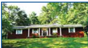
10607 Rieker Dr., Ashland - 3 BR, 2 BA, 2 car garage. You won't want to miss out on this beautiful ranch brick home! $159,500 (CCJ)