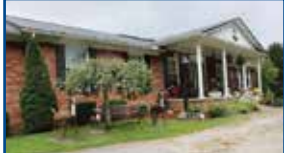
85 Rose St., Louisa - Must See one floor ranch style w/beautiful lg lot, in-ground pool, 4 BR, 2 BA, newly remodeled kitchen & lg DR. $173,600 (EM)