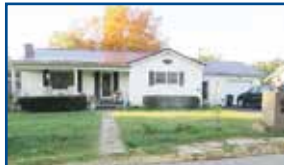
1117 Griffith Ave., Grayson - 3 BR, 1.5 BA ranch on 2 lots. New metal roof in '16 & heat pump in '13. LR, DR & kitchen. Beautifully maintained yard! $98,900 (PC)