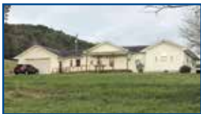
418 Wilson Creek Rd., Grayson - Great country location close to town. Beautiful 3 BR, 2 full BA w/2 car garage! Stunning views with so much to offer! Don't miss out! $169,000 (LF)