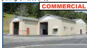
5005 Lake Bonita Rd., Catlettsburg - PRIME COMMERCIAL LOCATION! Within 3 to 4 minutes of I-64 & US 23 intersection. 42+/- Acres. Commercial Warehouse/Bldgs, offices & mobile home. $650,000 (CCJ)