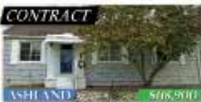
CONTRACT ASHLAND $118,900 2750 TERRACE BLVD Looking for a home for your family to enjoy? You'll want to see this 3 BR/2 Bath home in this desirable neighborhood!!