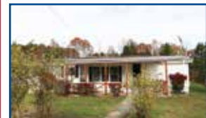
31091 Prichard Dr. Catlettsburg - This home is a must see! 3 BR, 2 BA, located right off 23. $55,900 (EM)