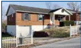
1801 Booth Quillen Rd., Ashland - Offering 3 BR, 2.5 BA, this home has been updated & meticulously maintained. Eat-in kitchen, full fin. walkout bsmt. $124,500 (CCJ)