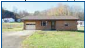
191 Teague Dr., Greenup - Take a look. Well maintained 2 BR brick ranch on 8 level lots. Newer roof, guttering & water heater. $69,900 (LS)