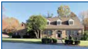
2700 Auburn Ave., Ashland - Start your story in this Cape Cod brick home offering 4 BR, 3 BA, 2 car garage. You won't want to miss out on this. $324,500 (CCJ)