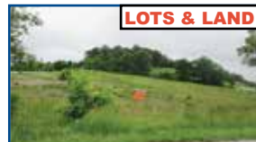
LOTS & LAND

0 Water Woods Estates, Greenup - The area's newest housing development combines the pristine beauty of nature with the conveniences of today. Each lot is 1.5 acres with gorgeous water features. $75,900 (TM)