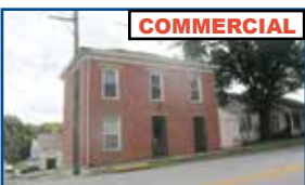
301 W. Main St., Grayson - Across from Carter Co Court House. Once was 2 attorney offices - 1 on main and 1 upstairs. Owner could live upstairs. $129,900 (PC)