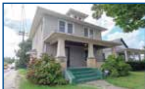
2646 Moore St., Ashland - Charming 3 BR, 2 BA w/HW floors. DR could be 4th BR. Laundry on main. $94,500 (CH)