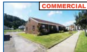
409 Belfont St., Russell - Office building with 2001/3000 sq.ft. +/- with a 25 spot parking lot. $175,000 (CCJ)