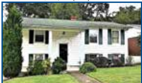
2849 Court St. - 2 BR, 2 BA bi-level offering 1,694+/- sq.ft., formal LR, fully equipped newly remodeled kitchen, DR & FR. On quiet street w/cul-de-sac. $104,900 (JRD)