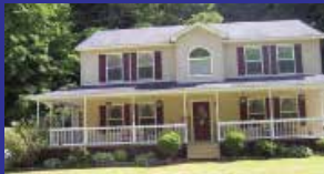
3525 St. Hwy 396, Olive Hill $155,900 3 BR, 2.5 BA, 4+/- acres. Nice 2 story in country setting, WB frpl, 2 heatpumps, wrap-around porch plus more. Franci Burchett 923-6168