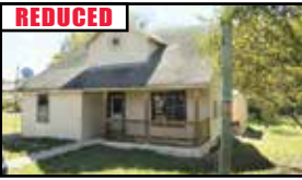
1324 Winifred St. - Quaint 3 BR close to downtown Greenup. LR & DR each have a frpl. Motivated Seller. $47,900