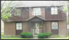
2532 Hackworth St. - 4 BR, 2.5 BA, fireplace in FR and add'l parking due back with a 2 car carport. $149,200