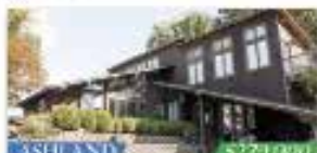
2323 HILLCREST RD Unique contemporary home in rustic setting! Floor to ceiling windows overlooking woods and city.

Let Us List Your Home And You Can Experience The PARAMOUNT Difference!