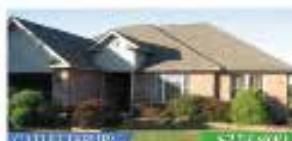
5040 LAKIN DR Brick ranch home with 4BR and 3 Baths and a fully finished, walk out basement.