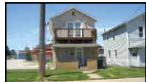
229 35th St. - Great 2 BR, 1.5 BA. Updates. Lg LR. Semi-open floor plan and spacious eat-in kitchen, side deck. $75,000