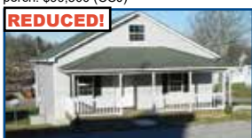
402 W. 2 nd St. - 4 BR, 2 full BA Cape Cod style home offering 1,300+/- sq.ft. of living space, lg level lot, spacious kitchen w/updated cabinets & counter tops, updated electrical & plumbing, updated BA fixtures, newer floor covering & fresh paint & separate laundry room + more! $92,900 (JB)