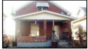
332 23rd St. - Commercial bldg currently a doctor's office. Close to Central Park w/ on-site parking. $275,000

112 Dunbar Court - Residential Lot. $6,000