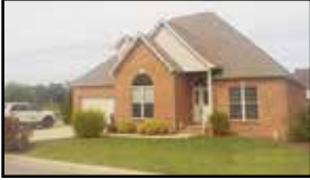
5300 Poplar Ridge Dr. - 4 BR, 2.5 BA w/ master suite on the main floor. DR, FR w/ gas log frpl. $269,900