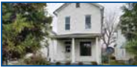
2021 Central Ave. - Investor Alert! Handyman project. 3 BR, 1 BA 2 story "fixer upper". Across from Central park. Needs everything: ie roof, windows, hvac, etc. This home is no habitable & will not qualify for conventional financing. Proof of funds required with all offers. $25,000 (GD)