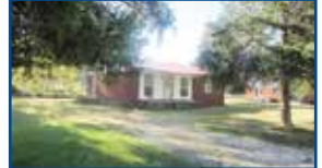
127 Wildcat Dr. - 3 BR, 1 BA brick ranch offering 1,092+/- sq.ft. & being sold "AS IS". Needs TLC! Level lot within city limits. Has metal roof, front porch. House is in Burchett Littleton Subd. $39,900 (PEC)