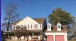
1009 Lynn Ct., Russell $224,900 4 BR, 2 full & 2 half BA, nice home w/updated kitchen w/granite counters, SS appliances, carpet & paint. FR w/WB stove, 50x32 deck & more.