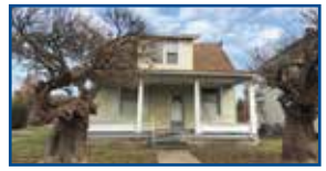
2937 Hampton St. - 3 BR, 2 BA Cape Cod style offering 1,656+/- sq.ft. in need of some TLC. Sellers looking for the right person to bring this place back to life. On a very nice lot in a beautiful neighborhood. "BEING SOLD AS IS" $25,000 (LF)