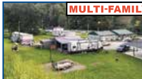
MULTI-FAMILY 2261 Ky Rt. 3379 - Two singlewide trailers & 2 apts w/rental income of $1,650/mo. Parking in driveway. Can be sold w/#44494 that is next door. $200,000 (RC)