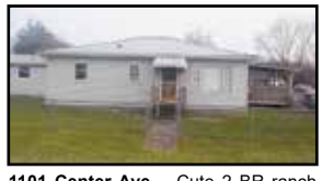
1101 Center Ave. - Cute 2 BR ranch home in Worthington. 12x14 porch, eat-in kitchen, FR & lg laundry rm. Original HW floors under carpet. 12x16 bldg $57,900