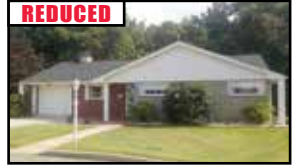
2400 Bradley Drive - Family/DR, LR, kitchen, 3 BR, BA on the main + 1 BR, full BA, kitchen, FR & lg in bsmt. $139,900