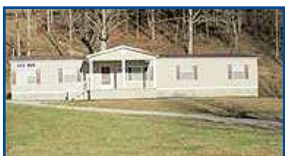
307 Old Rt. 773 - Remodeled 28x72 double-wide w/block perimeter, newer carpet & paint, 4 BR, 2 full BA, lg FR & DR/Kitchen combo. Front porch! Title has been converted to real estate. $95,900 (PEC)