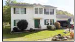
2615 Oak Hill Lane - 3 BR, 2.5 BA, Lg kitchen w/stainless appliances, LR, DR, 2 car garage. $134,900