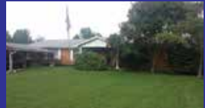
6104 Margaret St. $129,900 3 BR, 2 BA spacious ranch. Original HW floors in MBR, LR & add'l BR under carpet. 1,736 sq.ft. Angela Coovert 571-6296