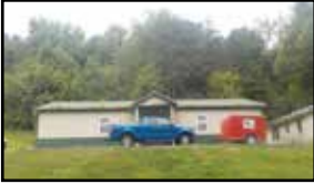
9220 Campbells Branch - Business & 2 BR, 1 BA home? Off US 23. 3+/- acres. 28x60 metal bldg. $69,900