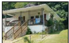
642 28th Street Ranch style featuring 2 BR in need of TLC. $24,900