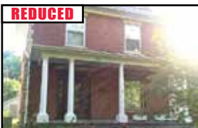
1808 Lexington Ave. - Across from Central Park. 6 BR, 2.5 BA, 2 car det garage. Apx. 2,195 sq.ft. of generous space, yet quaint & cozy. $199,000