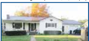
1117 Griffith Ave. - 3 BR, 1.5 BA ranch on 2 level lots. Move-in ready w/LR, DR & lg kitchen. New metal roof in 2016 & new heat pump in 2013. Close to Carter Caves, Cave Run, Grayson & Greenbo Lakes. $98,900 (PEC)