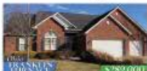
944 BRAUNLIN RD Marina Home has 4 br, 3.5 ba, large deck, upstairs bonus room, Patio, level lot with riverview. Office.

Let Us List Your Home And You Can Experience The PARAMOUNT Difference!