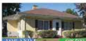
1401 NICHOLS PL 3BR brick ranch home on corner lot with 2 car attached garage. Partially fenced yard and gas log fireplace.