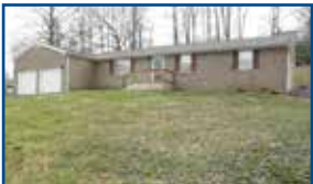
345 Keeton Ct. - This 3 BR, 1.5 BA ranch style home w/1,450+/- sq.ft. is in Westwood. Kitchen is fully equipped & offers solid surface counter tops w/lots of cabinet space. Att 2 car garage & fenced yard make this home a win-win! $103,900 (LS)