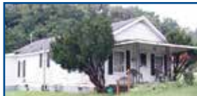
8560 Cemetery Rd. - Great investor property w/potential. In need of repairs. Close to shopping & schools. Garage in poor condition. 36 th St. & Cemetery Rd are the same street. Call for a showing today! $19,000 (DS)