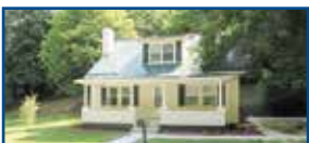
1616 St. Hwy 1 - Remodeled 3 BR, 2 BA older home. Newer siding, roof, windows, kitchen cabinets, BA, vinyl stained counter tops, refig, stove, sink & microwave. Newer front & back porch. Nice yard. Move-in condition. Selling "AS IS" will allow up to $2,000 in closing costs. $109,900 (PEC)