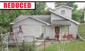
1520 Stallard St. - Very private. Well maintained with recent updates. Eat-in kitchen, lg deck, 3 BR, 2 BA. $56,000