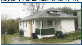
2208 Moore St. - 3 BR, 2 BA, 1,425+/- sq.ft., bsmt, HW floors, gas frpl, eat-in kitchen w/all appliances, off-street parking & back yard that is over 400 ft long. A great starter home or for downsizing. Has everything on main level. $89,900 (JR)