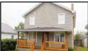
2939 Dale St - 5 BR (4 BR up & 1 BR on main), 3 full BA. New shingles, new back deck leading to inground pool. $129,900