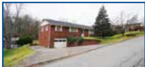
1004 Commanche Dr. - 3 BR, 2 full BA, brick home offering 2,296+/- sq.ft., 1 car built-in garage, formal LR & DR, kitchen w/laundry facilities & new refrigerator (wall oven in 2016), screened deck area off kitchen overlooking the back yard, gas furnace & AC less than 1 yr old. Roof in 2015. $114,500 (CCJ)