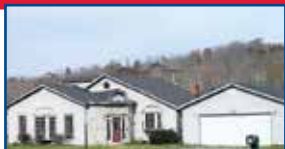
18312 W. US Hwy 60 - 4 BR, 2.5 BA on appx. half acre featuring separate living & family rooms, lg eat-in kitchen w/appliances, several multi-purpose rooms & so much more! Plus adjoining apt w/separate kitchen. (JB) $129,900 (JB)