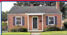
3412 Euclid Ave. - 3 BR, 2 BA w/1,520+/- sq.ft. on lg corner lot. Offering remodeled kitchen w/newer cabinets, granite counter tops, SS appliances & waterproof floor. 1,050+/- sq.ft. unfin bsmt. Fenced back yard AND MORE! $127,500 (DC)