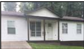
8043 Carlisle Dr. - 3 BR & 1 BA on lg lot. Fresh paint, lg laundry room & 11x24 storage room could be 4 th BR or FR. $55,500