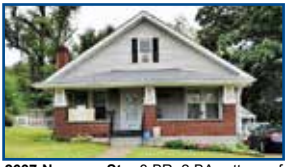
2637 Newman St. - 3 BR, 2 BA cottage offering extra lg fenced lot, lg LR/DR combo, nice size eat-in kitchen w/lots of cabinetry, full unfin bsmt w/workbench area, laundry room & some great updates! $99,900 (LF)