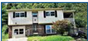
218 Cardinal Dr. - 4 BR, 1.5 BA 2 story w/1,716+/- sq.ft. 2 walk-in closets, newer metal roof, newer windows, painted interior & exterior. Some newer doors. Nice porch on right side replaced. New heat pump in 2016. $99,900 (PEC)