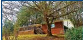
713 Indian Hills - 3 BR, 2 full BA ranch-style home w/1,608+/- sq.ft. on 1+/- Acre. The lg front deck offers a beautiful view. Private patio in back. New carpet throughout, fresh paint & move-in ready. Kitchen is fully equipped + breakfast bar. DR w/stove pipe for woodburner. $124,900 (LF)