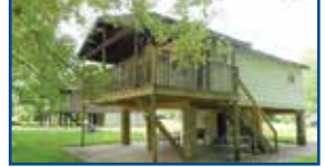
342 Murfield Land - Cozy cabin on Little Sandy River features combo living, dining & kitchen w/2 BR, laundry room w/washer & dryer & double lot. Watch the boats go by while you are sitting on the upper deck. $40,000 (LS)