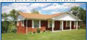
102 Jane Lane - 3 BR, 2 BA ranch-style home w/built-in 2 car garage, unfin walk-out bsmt, woodburning stove, back deck & level yard. $109,900 (CCJ)