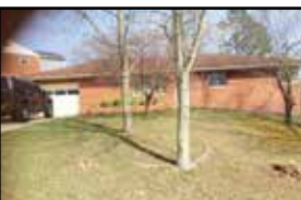
419 Cardinal Rd. Traditional brick 3 BR ranch has lg LR, DR & kitchen combo that opens to the patio to enjoy the back yard. $95,000