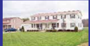
395 Sweetwater Lane, Grayson $199,900 4 BR, 3.5 BA, lg 2 story. 3 BRs have their own BA. Kitchen w/granite counter tops plus more. Jody Mayo 922-4200