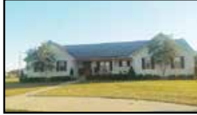
1013 Cedar Point Circle - 3 BR, 2.5 BA, Open kit. w/SS appliances & island, DR, FR, HW floors, IG pool. $299,900