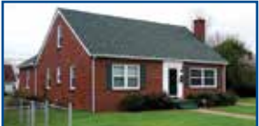
2608 Hampton St. - 3 BR, 2 full BA offering 1 car det garage, 1,412+/- sq.ft. of living space, arched entryways, frpl, kitchen w/cabinetry & breakfast bar, HW floors throughout & so much more. Outside is a covered patio, fenced yard & carport. $119,500 (CCJ)