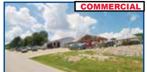
COMMERCIAL 1056 Damron Branch - 7+/- Acres complete with 7 BR, 3.5 BA residence w/new CH&A. Business opportunity includes thriving auto repair shop w/16' ceilings, hydraulic lifts & industry tools. Also 6 greenhouses w/forced air heat & water drips! $549,000 (JR)