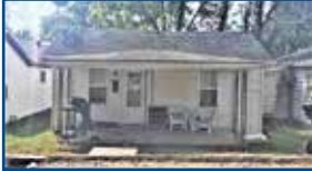
2408 Main St. - Cottage style 2-3 BR home for investment or 1 st time home buyer. Located within Ashland City. Neighborhood convenient to schools & shopping. Call for your appointment today. $40,000 (LG)