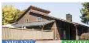
2315 HILLCREST RD Home with over 1800 sq ft of living space on 2 floors with an open, carpeted space in the basement.