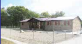
105 Vincent Rd., Grayson $239,900 4 BR, 2 BA brick ranch on 6+/- Acres. Acreage would be great for housing development or mini-farm. Plus so much more. Come See! Jody Mayo 922-4200