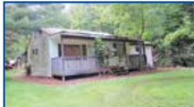
218 Marshall Hollow - 2 BR, 1 BA home needs work to be habitable. Selling "AS IS". Enclosed back & front porches. Needs major work. Lot adjoins stream. Seller says property has not flooded since they have owned it. $25,000 (PEC)