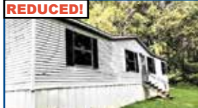
REDUCED! 407 Bourbon Hollow Rd. - 3 BR, 2 BA doublewide offering 1,344+/- sq.ft. on 1.23+/- acres. $39,900 (KD)