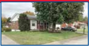
2813 Court St. - 4 BR, 2 BA, 1,530+/- sq.ft., 1 car att garage, bsmt w/Mother-in-law quarters & full kitchen, enclosed patio off DR, HW floors & so much more! $125,000 (RW)