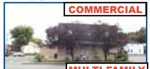
COMMERCIAL 514 29 th St. - Great investment opportunity! These properties include offices, storage area, workshop, garage & laundry mat. Plus one 2 BR apt, three 1 BR apts & two 3 BR houses in the rear. Great location & visibility! Office for rents, etc. $375,000 (PC)