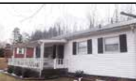
6244 St. Rt. 5 - Boyd Co ranch home w/3 BR, 1 BA, front porch & 1 car carport. $49,900