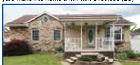
1508 Valoria St. - 3 BR, 1 BA ranch in Russell school district offering 1,068+/- sq.ft., flat fenced lot w/inground pool, pool house & covered patio area, fully equipped eat-in kitchen, laundry room & covered front porch. $99,500 (CCJ)