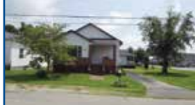
411 West St. - Nice 2 BR, 1 BA cottage on level lot. Great for 1 st time home buyers or anyone wanting to downsize!! Call for appointment today! $45,900 (PC)