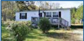
18003 Trace Rd. - 2 BR, 2 BA doublewide on 13+/- private & partially wooded acres. The possibilities are MANY. The entrance to Rush OFF road is just mins away if you like that 4-wheel riding kind of thing. Being sold "AS IS". $120,000 (LF)