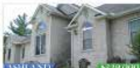
832 COUNTRY CLUB DR Lovely 4 BR, 3 Bath home in Bellefonte. 2 additional lots included that connect to this property in the back!