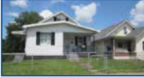
2013 N. Belmont St. - 3 BR, 2 BA remodeled home w/new carpet/vinyl flooring, partially painted interior, unfin bsmt & fenced back yard. Upstairs is one lg room that could be MBR or FR. Ideal for rental property or family. $49,000 (PEC)