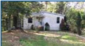
38 S. Carolina Dr. - 2 BR, 2 BA doublewide w/1,680+/- sq.ft. on 1.23+/- Acres & offering central air! There is even a frpl in the spacious FR. Bank owned & being sold "AS IS, WHERE IS". $39,900 (KD)