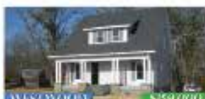
2856 MAIN ST This 3 bedroom/2 bath home has been completely renovated!!! Also has a new 12 x 12 deck. Call to see today!