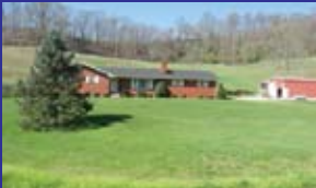
7916 Cannonsburg Rd. $309,900. 4 BR, 3 full BA Ranch Brick on 15.5 acres, HW on main floor, finished Bsmt. w/full kitchen & BA, 2 covered porches, barn, shed. A Must See! Don Kirk or 922-9091 Libby Fugitt 571-6401