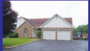
1838 Paradise Lane $299,900 3 BR, 2.5 BA ranch on 1.5 acres, much larger than it appears, fin basement, geo thermal heating, double pane windows, 2 car att. & det. garage. Ross Gray 923-5358