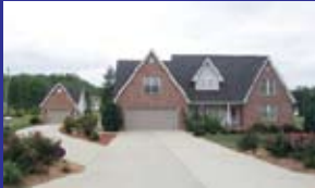
294 Greenbrier $319,900 3 BR, 2.5 BA, beautiful 2-story brick. Formal LR, lg. dining room, MBA on main & much more. Nancy Burchett 922-6263.

2112 Argillite Road Flatwoods, KY. 41139 606-833-0007