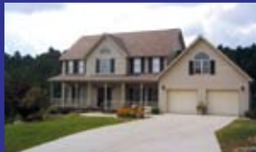
375 Iron Furnace $299,900 4 BR, 2.5 BA on 1.28 acre, Lg. kitchen w/maple cabinets, 2 armoires, gas log Frpl., garden tub & shower in MBA, Much More, Must See! Libby Fugitt 571-6401