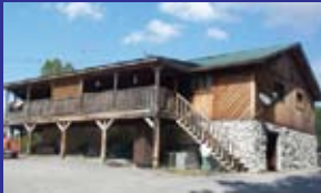
105 Three Pine Circle, Olive Hill $299,900 20x70 det. garage, 14x36 outbldg & stocked pay lake. Could be subdivided. Kevin Haney 316-3779