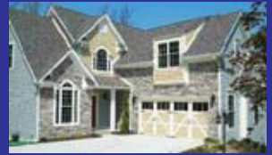
1015 Red Maple Ridge $289,000 4 BR, 2.5 BA, stone & wood exterior, open floor plan, stone fireplace, main floor MBR, BA & utility room. Vaulted ceiling in great room. Judy Robinson 923-3135