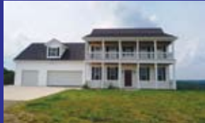
454 Rolling Hills $309,900 4 BR, 3.5 BA, Southern plantation with 4 porches on 3+/- acres, HW on main, raised counters in kitchen & BA, much more! Judy Robinson 923-3135