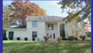
126 Stoneybrooke $319,000 4 BR, 4.5 BA, recently updated carpet, stairs, paint, kitchen, light fixtures, spacious great room w/stone FP, main floor could be 5th BR. Much more. Judy Robinson 923-3135