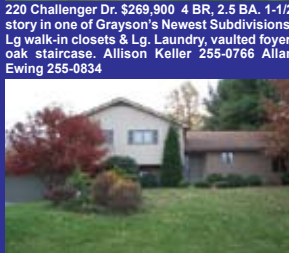
157 Partridge $259,900 4 BR, 3 BA, master BA has jet tub, family room w/wet bar, 2 level decking, screened porch, workshop area in garage. Judy Robinson 923-3135