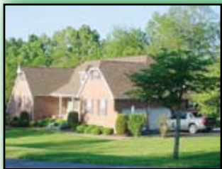
218 Woodland Way Grayson, KY.

1.5 Story Brick, 4-5 BR, 2.5 BA, DR, 2 Family Rooms, Beautiful Yard, 2 Car Garage, Deck. $289,999