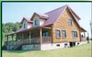
11316 N. State Highway 7 Grayson, KY.

Underground home of 6000+/- Sq Ft. 5 BR, 4.5 BA, 2 Family Rooms, Dream Home for Large Family. Quality Kitchen and Baths. 2 Car Garage. $349,900