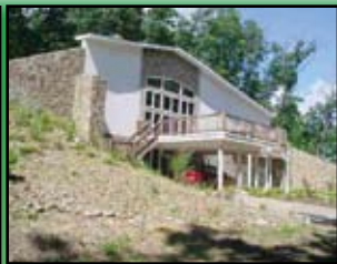
232 Windy Creek Grayson, KY

1.5 Story Brick, 4-5 BR, 2.5 BA, DR, 2 Family Rooms, Beautiful Yard, 2 Car Garage, Deck. $289,999