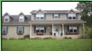
366 Plantation Dr.

2 Story, 4 BR, 3 BA, 2 car garage. $244,000 $239,900