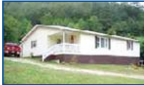
Prestonsburg - Great house in great location at great price! 7+/- acres, 5 BR, 2 BA, large LR & DR w/open floor plan. $99,000 #28863 (PS)