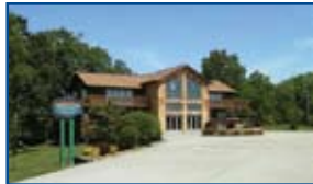
Louisa - Beautiful, breathtaking, very private contemporary 2 story duplex w/common space on 28+/- acres. #211571/#21159 $475,000 (CJ)

1627 Greenup Ave • Ashland, KY 41101 Each office independently owned and operated