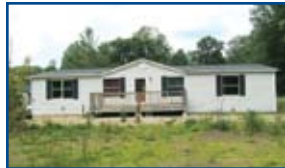
Argillite - PRIVATE! 27.5+/- acres of mostly flat land w/3 BR, 2 BA manufactured home. Perfect for hunting/fishing retreat w/2 ponds. $118,000 #28150 (AH)