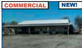
Flatwoods - Former landscaping business w/2 buildings w/1 being office space. Great Location! $339,000 #28887 (AH)