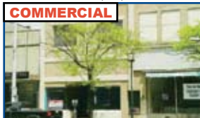
Ashland - Great Business Location! Downtown building boasting 28' long showcase windows w/full Bsmt. $125,000 #28666 (PC/PS)