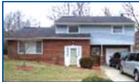
Ashland - Pretty brick & vinyl tri-level home w/fenced yard in nice area w/4 BR, 2 BA, FR, screened porch & deck. $115,500 #25402 (CJ)