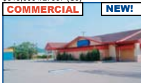
Ashland - LOCATION! Former Shoney's Restaurant. Huge traffic count. Access on all 4 sides w/88 parking spaces. $899,000 #28827 (TM)