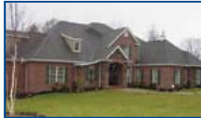
Bellefonte - New construction in Bellefonte Woods! Luxury is the only way to describe this 5 BR, 4+ BA home w/too many amenities to mention! $799,000 #27245 (CJ)