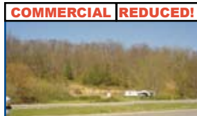
Boyd Co. - LOCATION! LOCATION! 9+/- acres within 0.1 mile from I-64/KY 180 exchange & Flying J's. $499,000 #25858/25864 (CCJ)