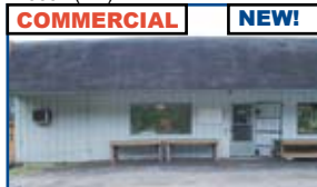
Pike Co. - Own your own business in great location! Includes all inventory. Access from front & alley. 2 phase electric. $89,900 #28871 (PS)