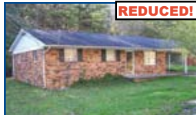
Grayson - Nice space & priced to sell! Great for starting out, downsizing or investment. $42,900 #27734 (BM/EAM)