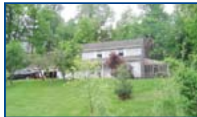
Russell - Beautiful 4 BR, 3.5 BA home on 3 lots in Kenwood Hills w/2 car att. garage & carport, game room, FR & more! $339,900 #28037 (BD)